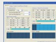
Remote Setup: Configure Recording Parameters and Schedule from remote location