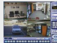
Remote Client: Log in over the network