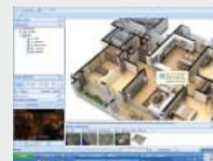
Central Monitoring Software