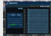
Search by Time