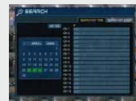
Search by Time